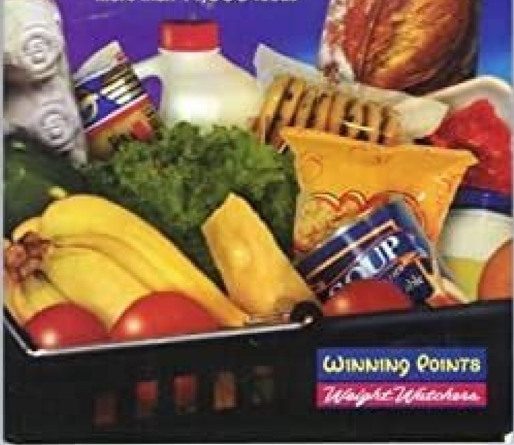
Weight watchers complete food companion book.

POINTS® values for more than 14,000 foods